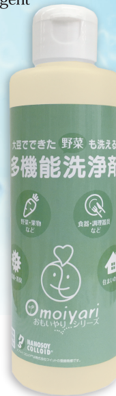
Cleansing/face wash gel

Wash off vegetables, fruits, meat and fish